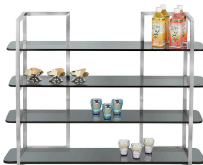
FOUR SHELVES INCLUDED