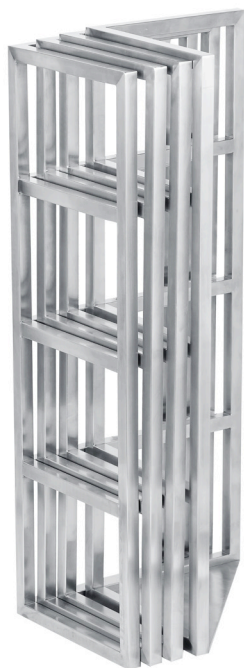
NESTING FOR EASY STORAGE