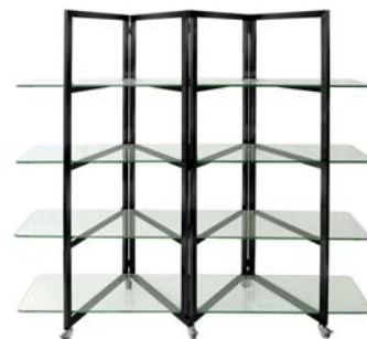
GLASS SHELVES/ XYLO FRAME MODEL #ST1880MB