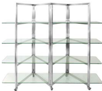
GLASS SHELVES/ STAINLESS STEEL FRAME MODEL #ST1880G