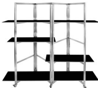
REVERSIBLE SHELVES/ STAINLESS STEEL FRAME MODEL #ST1880W